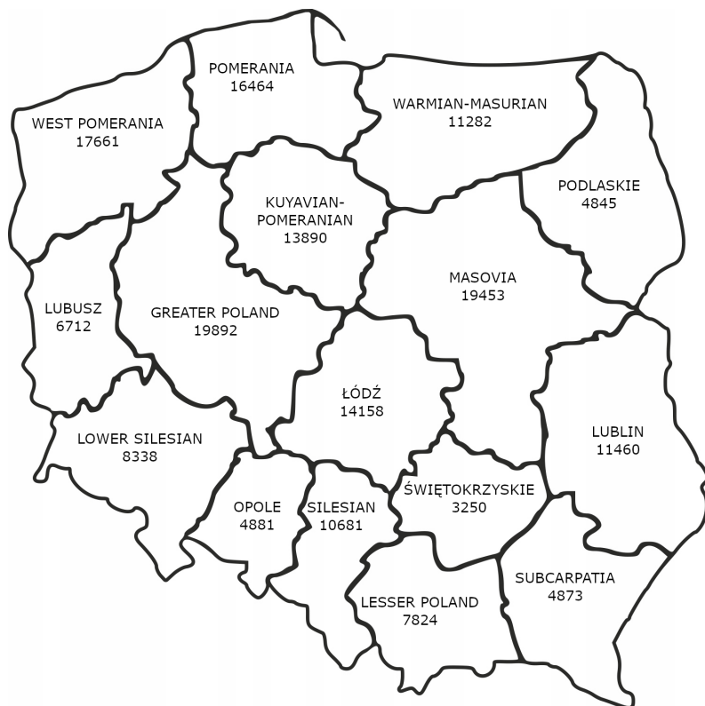
Figure 2. The number of mandatory quarantine checks by Police between March, 12th 2020 and Dec, 31st, 2020.

Own elaboration based on the Police data (request for access to public information).